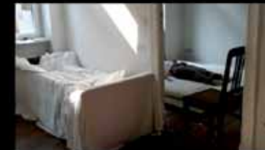
The point where the vanishing points meet.