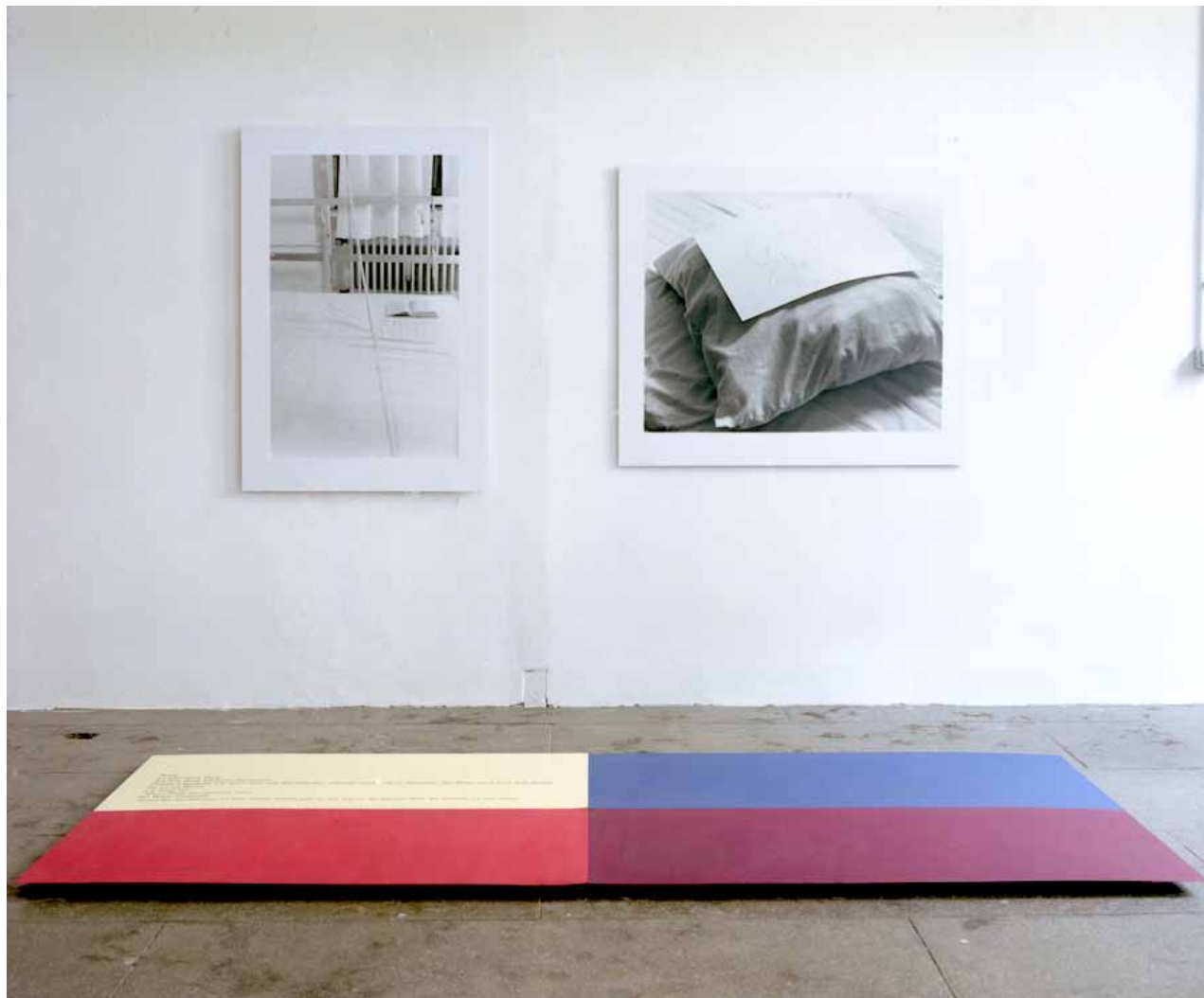
Open Doors, Sète

five texts, silk screen print on metal painted with acylic, 250/160cm two photographs, analog print mounted on dibond, 120/80cm, 100/120cm