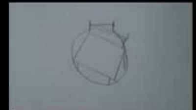
If the bed was circular.