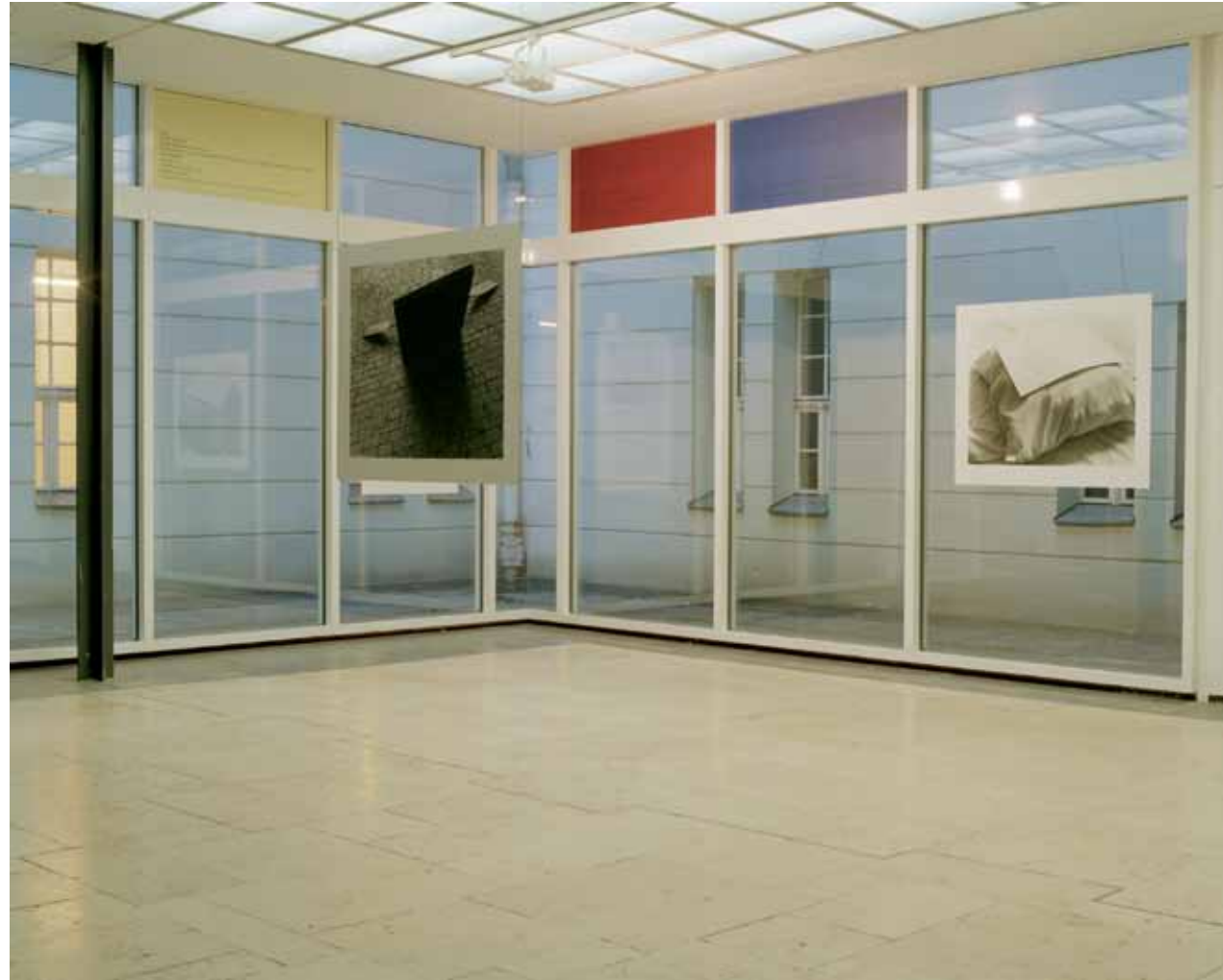
three photographs, analog print mounted on dibond, 120/100cm four slikscreen prints on metal painted with acrylic, 200/40cm

I, II, III, IV, V, VI, VII, VIII, IX, X, XI, XII, XIII, XIV, XV, XVI, XVII, XVIII, XIX, XX, XXI.